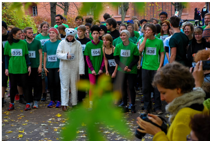
The making of a classic