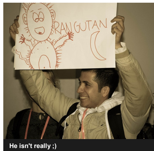
He isn't really ;)

The group recognised the value of openness and appreciation with an attitude of learning and taking something of value from their engagements at COY