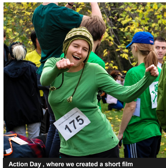
Action Day , where we created a short film